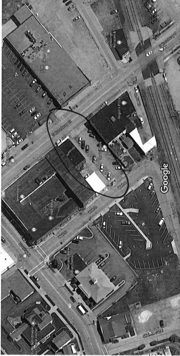
Imagery ©2018 Google, Map data ©2018 Google 50 ft